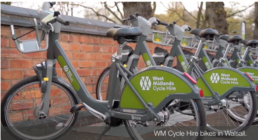
WM Cycle Hire bikes in Walsall.

This, in addition to the fact that 89% of respondents didn't feel like the existing network could fully connect them to where they want to go, and 76% didn't feel that the current network was inclusive, means that there is a clear need and desire to expand and improve the existing active travel network across the Black Country.